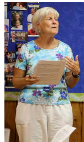
TCW gave Program at Potluck.