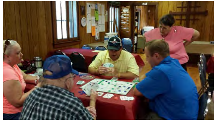
Game Day at M&M event in Sept.